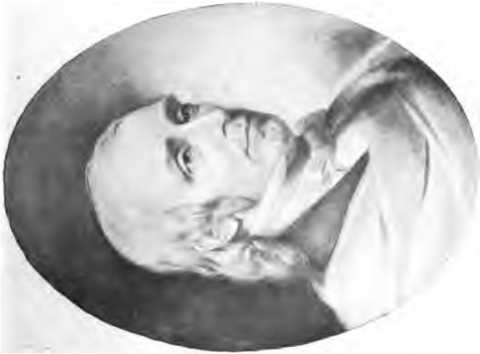
A. BRONSON ALCOTT AT THE AGE OF 53